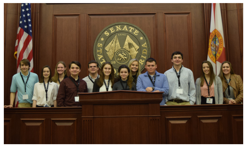
Students from the 2020 Youth Tour visit the Florida Senate Chambers.

It's almost 2022, and that means we're only a few short months away from Youth Tour 2022! Youth Tour is an annual program for high school juniors (and seniors this year) whose parents are CHELCO members. Participants get to experience a two-day, expenses-paid trip to Tallahassee in February to learn about the state government, electric cooperatives and their relationship with one another. It's also a great time to meet new friends and make lifelong memories.